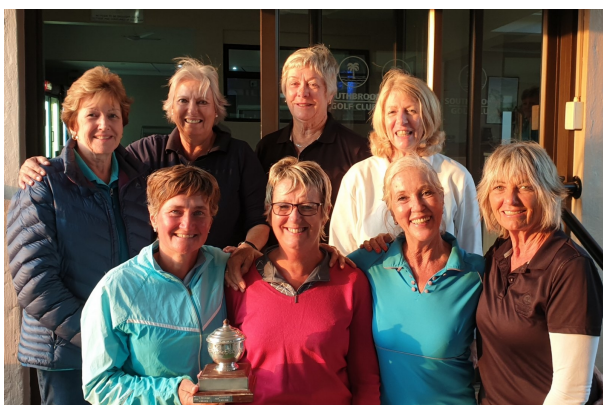
All the winners!