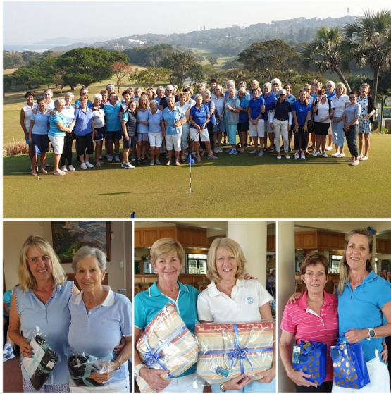
Ladies Open Day players & 1st 2nd & 3rd winners