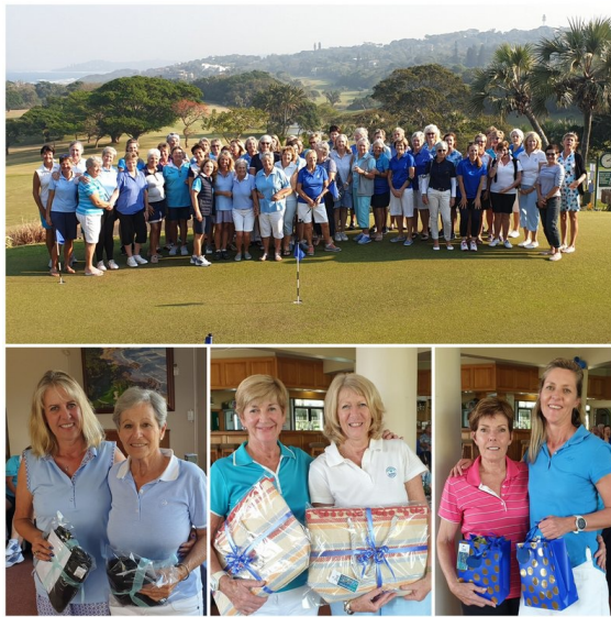
Ladies Open Day players & 1st 2nd & 3rd winners