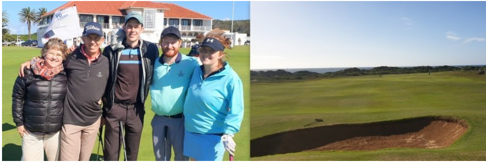
Very chilly & windy - but most enjoyable day at Humewood in Port Elizabeth this week