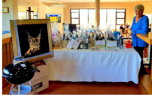
The laden prize table