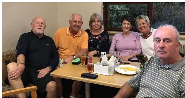
Business Day Victors