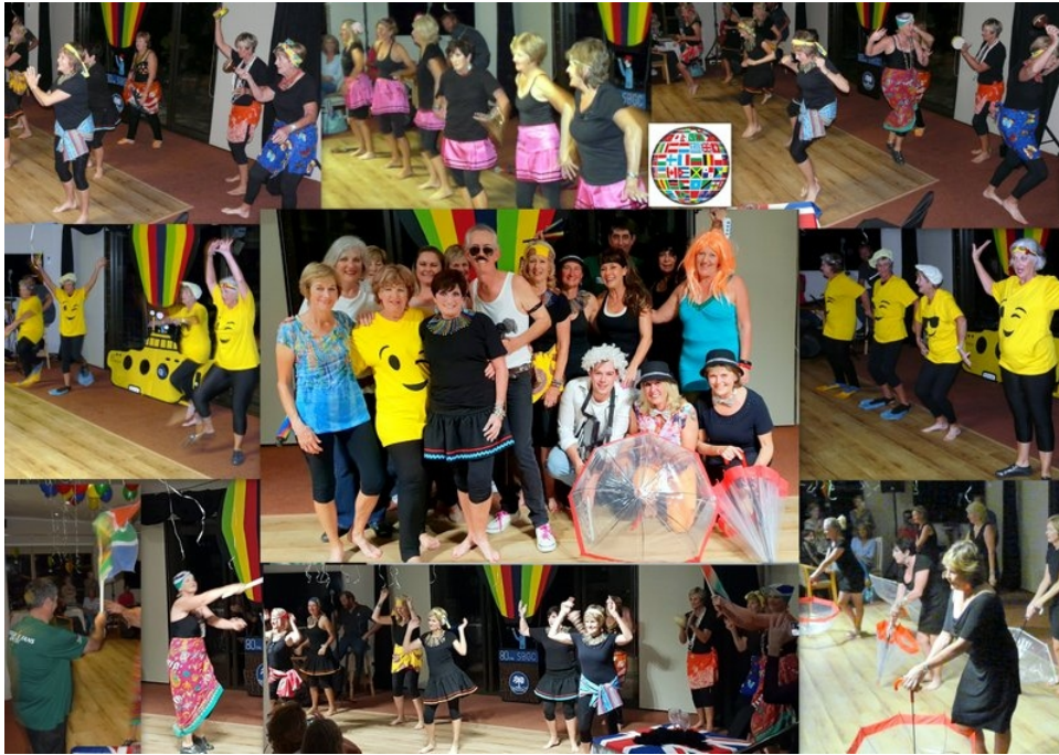
Southbroom Dance Troupe entertained all again with dances & guest artists from all around the world