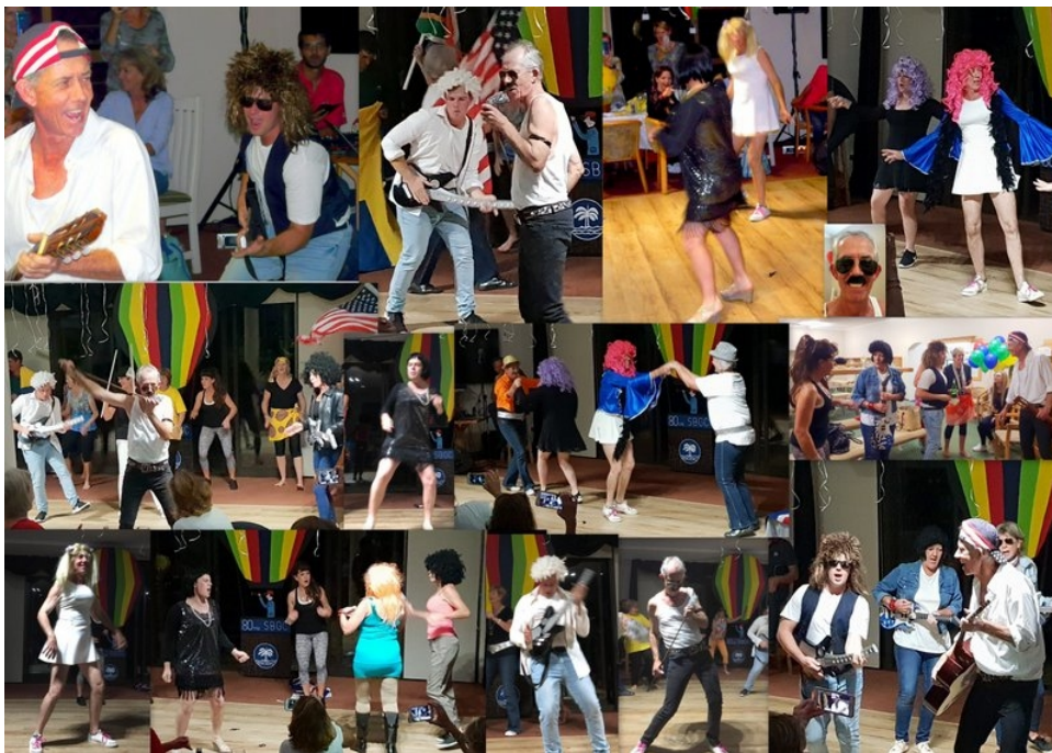
And ended off with Queen rocking the whole bar!