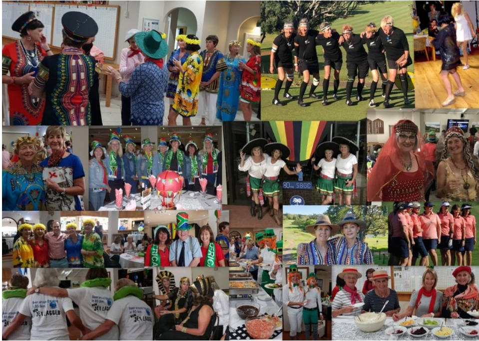
The players all dressed up to suit the great theme!

(The Beatles and Spice Girls), Sweden (ABBA), Spain ("La Macarena"), South Korea ("Gangnam style"), and of course to finish it off was Freddy Mercury with Queen - "We will rock you"!