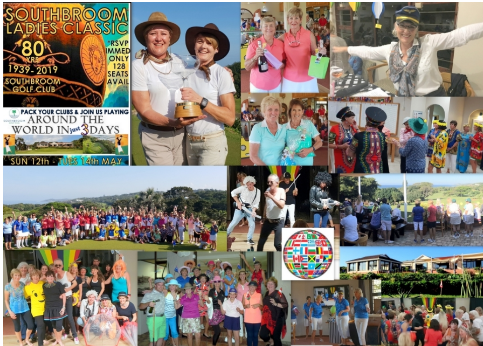
A quick snapshot of all the classic fun

Click here to see the 450 pictures on facebook.