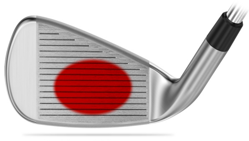
Small change; Big improvement

The great news is that the hitting zone has been extended on many better 2018 and 2019 Players Iron models to accommodate slight miss-hits towards the heel or toe. Ball speed is protected, and the distance the ball will travel is unchanged. That's a critical part of the accuracy a low handicap golfer must have.