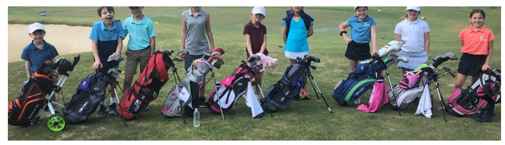
Get out and play some golf!