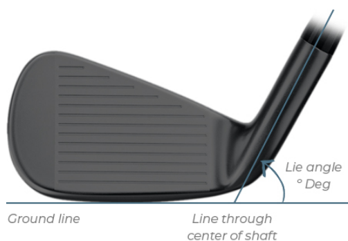
Lie angle too upright

The sole will be square to the turf at impact. You'll be straighter.