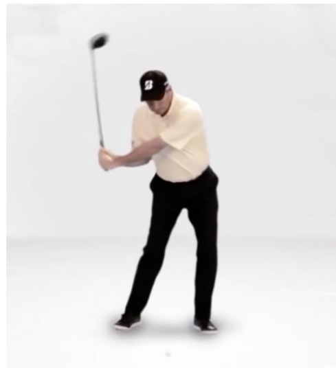
📷 Bridgestone Golf: Fred Couples' Golf Swing