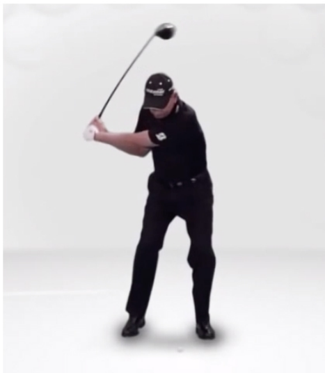
📷 Bridgestone Golf: Nick Price's Golf Swing

We've seen online fitting tools that ask you how far you hit your 5-iron. From there they estimate your swing speed. Then they recommend a shaft flex. What if we told you that two golfers, with the same swing speed, using great club fitters, had to use two wildly different shaft flexes?