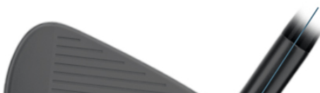
Lie angle too flat