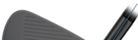
Lie angle too flat