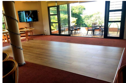
Ready to party ...