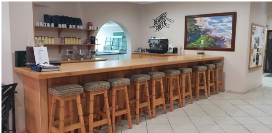
Beaver Creek coffee brewing especially for you! Pam is our trained barista

The new Coffee Bar area is gathering praise as surrounding folk are finding the Club a great place to come and relax! And this week a new dance floor was laid which will really help with functions in the bar! With the added seating area gained from reducing the size of the bar counter earlier on this year. It's great to have the extra space for tables etc!