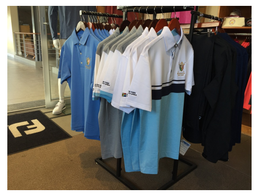
Support your club in style this summer!