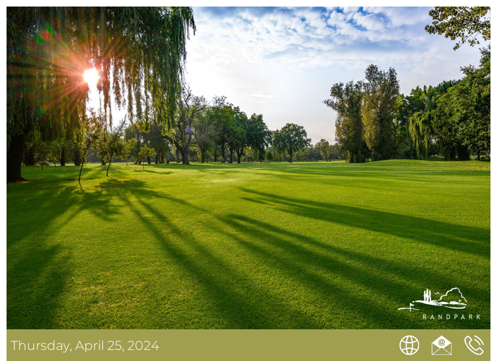
View online | Download a printer friendly copy