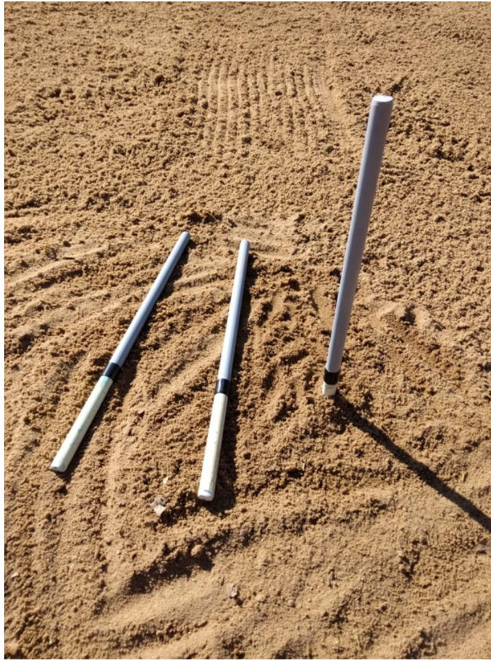
New sand probes for checking the sand depth

2. We are looking at coarser sand to top up the bunkers within the next few weeks. This will improve playability, but more importantly, ensure a more consistent experience all year round, taking into account seasonal changes. 3. Compressed bunkers are also a constant issue, especially when irrigation of courses start again. If bunker sand is shallow, contains fine materials such as fine sand, silt and clay, or has been contaminated with organic matter, like most of the bunkers on Bushwillow, it will retain moisture. Wet sand plays firmer than dry sand, so bunkers that receive more irrigation and retain more moisture will likely play firmer than those that are well-drained and out of the way of irrigation. A new system will be introduced to turn up the sand every week using the bunker rake machine. This programme will improve the sand compaction.