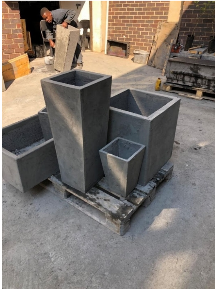
Carbon Footprint Recycling creates concrete-based products such as dustbins, vegetable planters and benches out of the recycled cartridges.