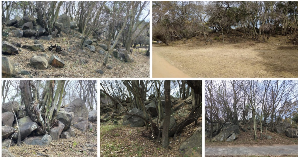
The 3rd pictures shows a White Stinkwood growing out of a rock

we will lose this very important habitat on our golf course. There are some beautiful indigenous trees in these koppies dominated by White Stinkwood, there are also Wild Olives, Buffalo Thorns, Blue Guarri and Firethorns. We have removed the invader plants and used a herbicide that is painted onto the cut stump to make sure they don't grow back. There is obviously a seed bank of invader trees and these areas will have to be managed to ensure that they don't get taken over. Visually, these areas are now very open so finding an errant golf ball will be far easier although the recovery shot may not be.