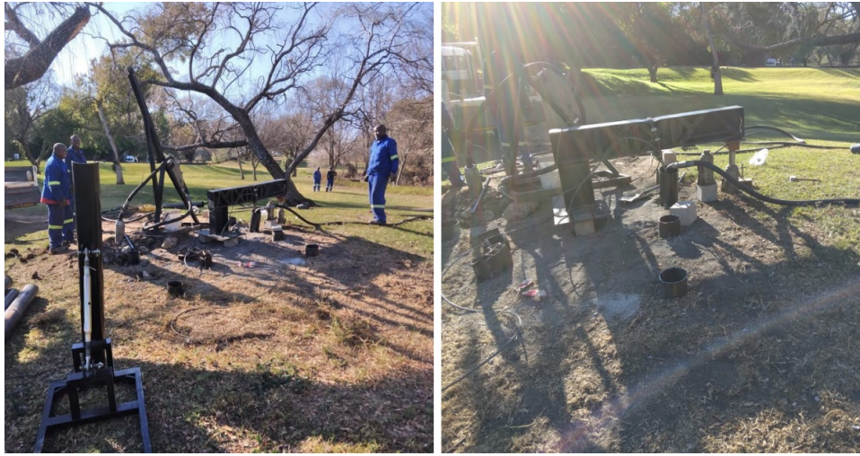
Piling in progress on the bridge