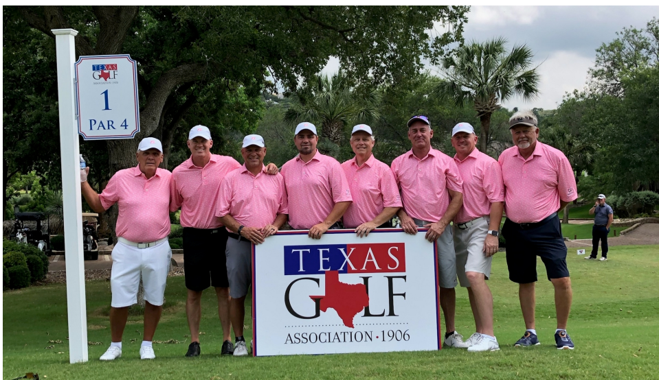
Gentle Creek State League Play