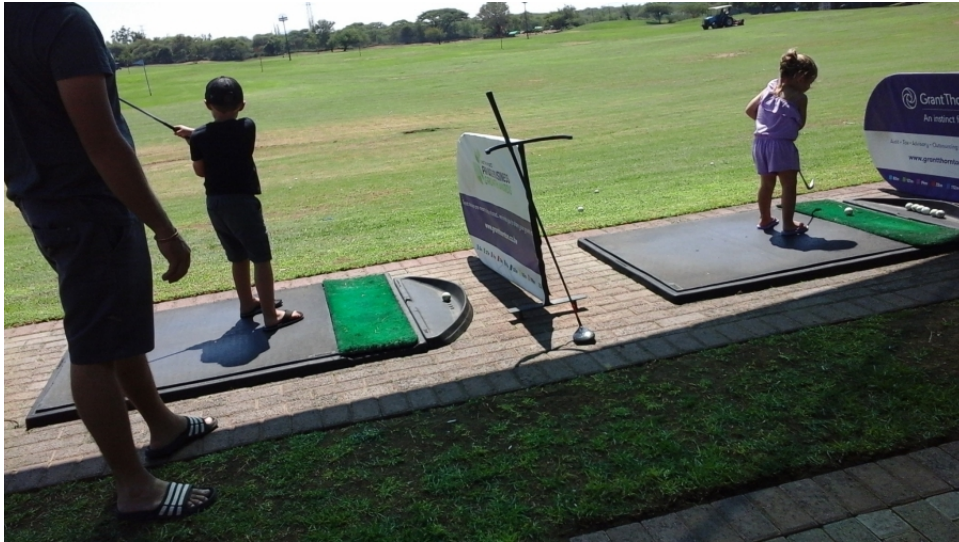
Young golfers at it

Is your child keen on golf or want to try something new during the school holidays, come and sign up your child.