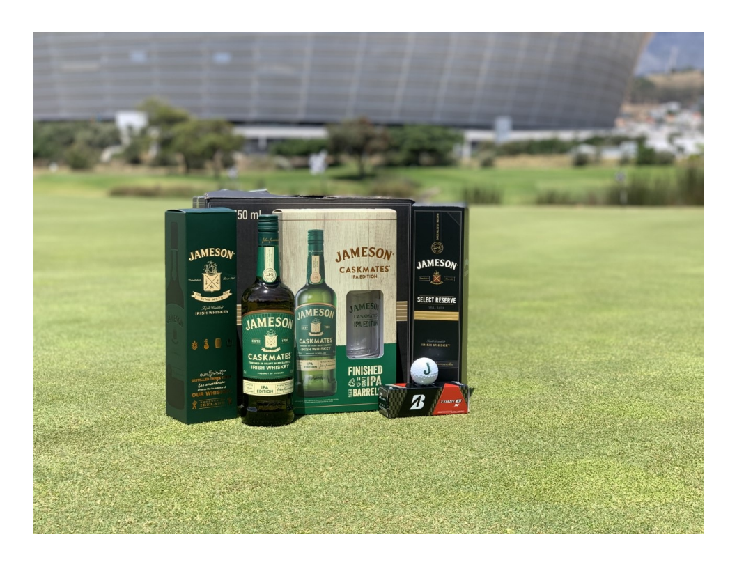
Start your weekend off right...

Tee times available from 16:41 to 17:38.