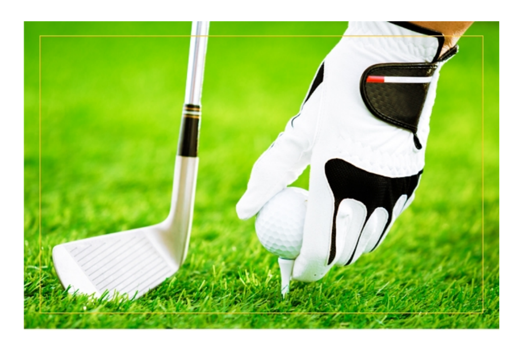
Better course management

Before you tee up at all, think about positioning yourself at a spot on the tee box that gives you the best angle into the green based on your natural shot pattern as well as the conditions.