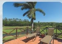
ONE BEDROOM STANDARD