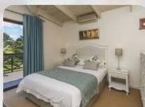
FOUR BEDROOM SUPERIOR