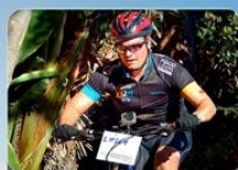
MOUNTAIN BIKE TRAIL 9.7 KM INTERMEDIATE