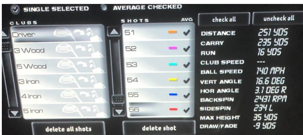
Results after The Golf Station fitting

After coming into the store, inside of about an hour, this was the result: A reduction of over 700 RPM of spin, a decrease of sidespin, and an increase of 15 MPH of ball speed increased his distance by 39 yards and gave him a straighter flight with his new Titleist TS2 Driver . I don't think anyone would balk at those numbers.