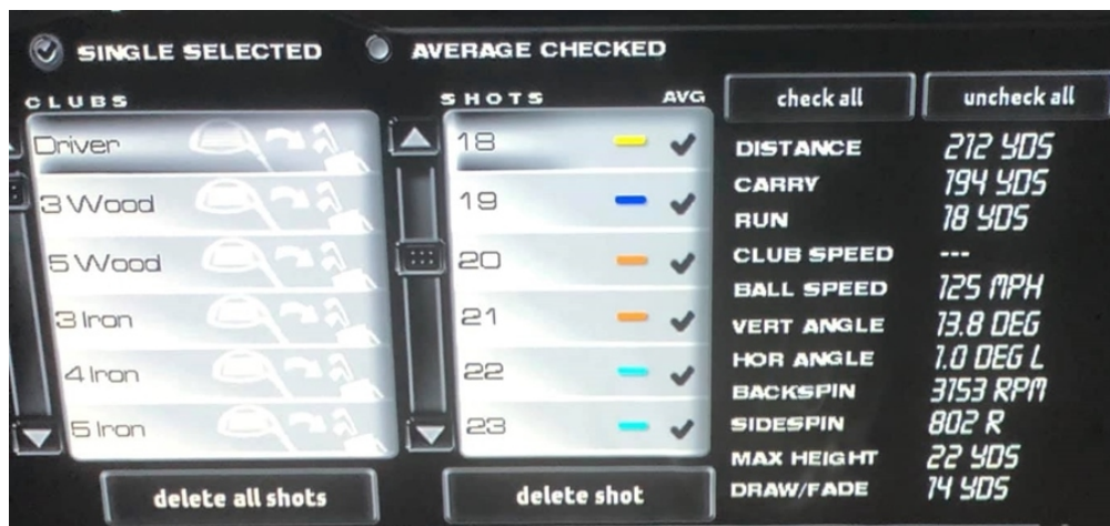
Results after being "fit"

Our next customer was "fit" by a what we will say is a "nationally based fitter" that builds all of their clubs offsite. They "fit" this gentleman into a driver that delivered 3153 RPM of spin and 125 mph in ball speed. By all accounts, it works, but those are not optimal numbers for anyone, let alone someone in their 60's with some physical concerns. He can play but was very dissatisfied with the performance of his Driver.